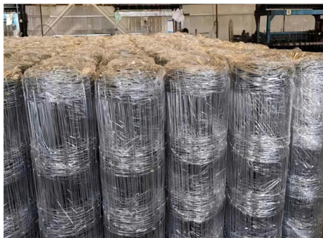
PLASTIC FILM PACKAGE