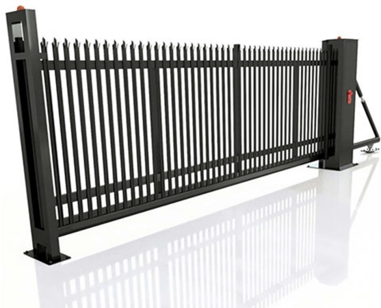
Palisade Fence Suspended Gate