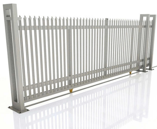
Palisade Fence Tracked Gate