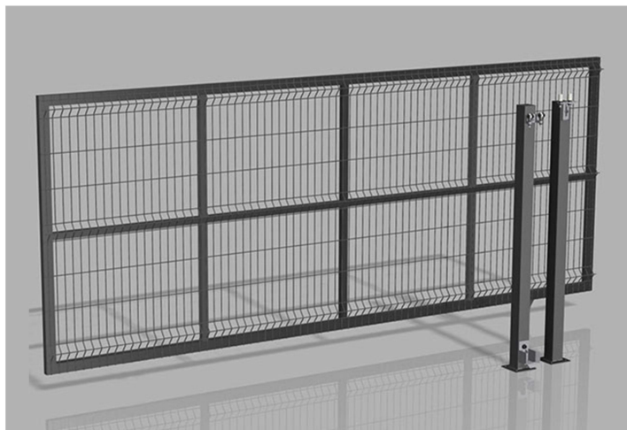
3D Fence Suspended-Gate