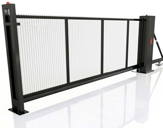
358 High Security Suspended Gate