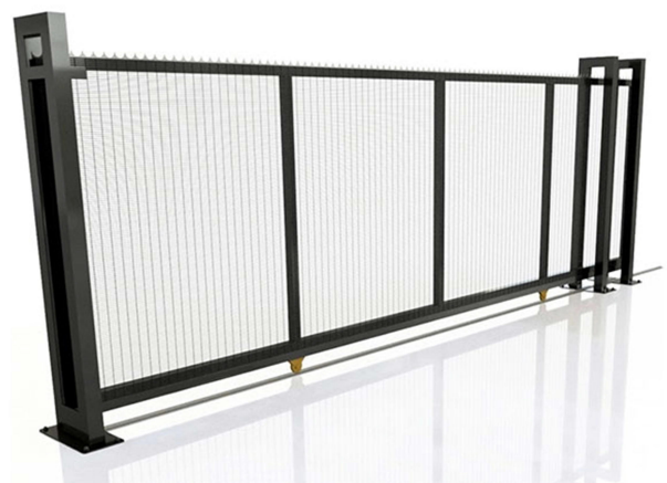
358 Security Fence Tracked Gate